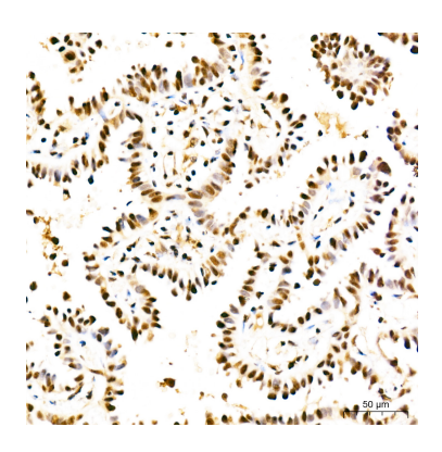
Immunohistochemistry analysis of USF1 in paraffin-embedded human lung cancer tissue using USF1 Rabbit pAb (A13560) at a dilution of 1:100 (40x lens). High pressure antigen retrieval was performed with 0.01 M citrate buffer (pH 6.0) prior to IHC staining.