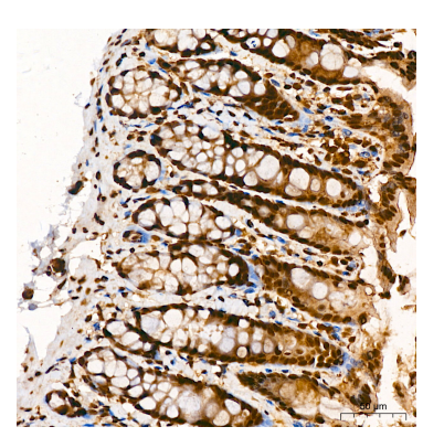
Immunohistochemistry analysis of EP300 in paraffin-embedded rat colon tissue using EP300 Rabbit pAb (A24352) at a dilution of 1:100 (40x lens). High pressure antigen retrieval was performed with 0.01 M citrate buffer (pH 6.0) prior to IHC staining.