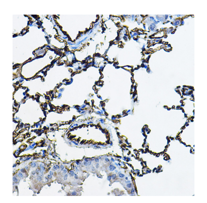
Immunohistochemistry analysis of paraffinembedded mouse lung using ACE11 Rabbit pAb (A2805) at dilution of 1:100 (40x lens). Perform high pressure antigen retrieval with 10 mM citrate buffer pH 6.0 before commencing with IHC staining protocol.