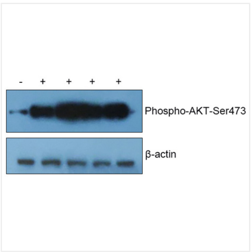
Recombinant Human EGF enhances AKT(Ser473) autophosphorylation in A431 cells. 10 ng/mL of Recombinant Human EGF can effectively enhance AKT(Ser473) autophosphorylation.